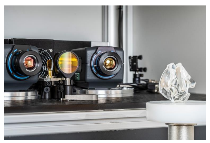
Fig. 3 The system works with thermal radiation for the 3D detection of transparent objects.